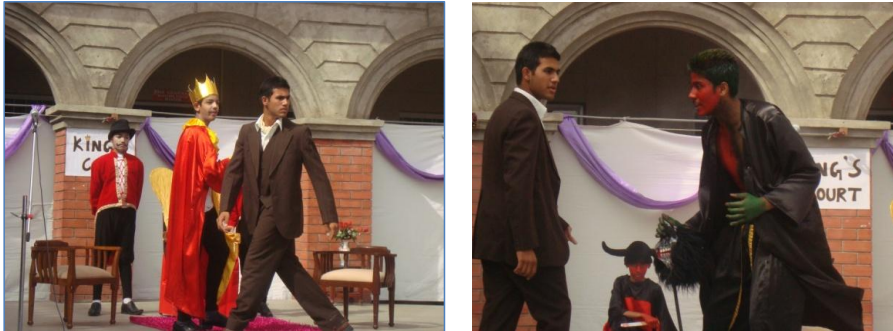
Teresa House Presentation