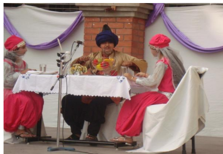
Tagore House Presentation